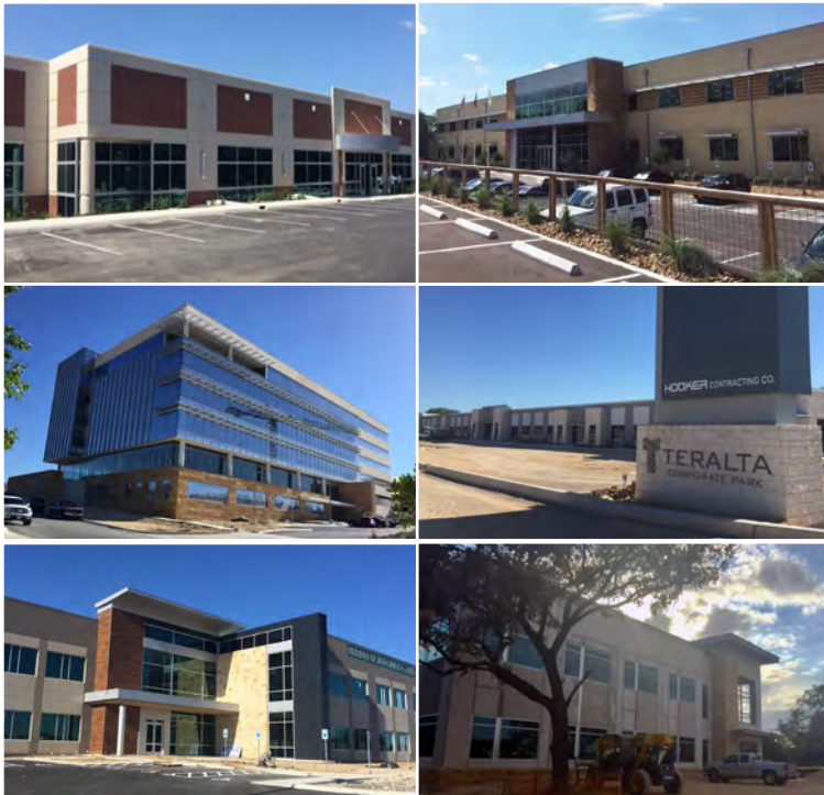
Clockwise from top left: University Oaks IV, GM Financial Campus, Landmark One, Teralta, One51 Phase II, Bella Vista.